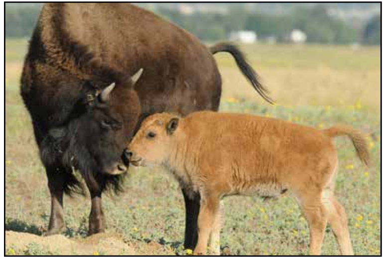
Bison cow and calf at Rocky Mountain Arsenal NWR

Just when we thought our wildlife encounters had peaked, we were in for another surprise. On our way back, we spotted a group of wild turkeys strutting through the grass. It was an incredible way to end our hike!