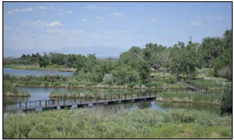
Rocky Mountain Arsenal NWR Lake Mary Loop Trail

We continued trekking across the breezy plains toward Lake Mary Loop, our turnaround point, making our total hike about two miles out and back. As we reached the lake, we were met with an incredible sight—a herd of eight mule deer grazing peacefully. We stood in awe, watching as they nibbled on grass, occasionally glancing up at us—especially when one of the kids got excited and started bouncing around!